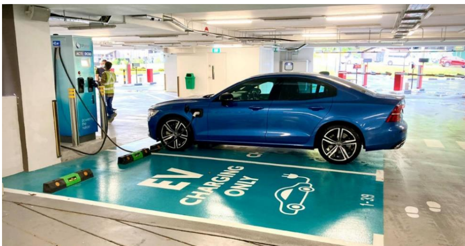
987 EV chargers to be installed at total of 314 sites