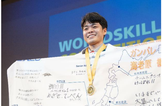
46th WorldSkills Competition award ceremony

• About the Monodzukuri Nippon Grand Award (Prime Minister Award)