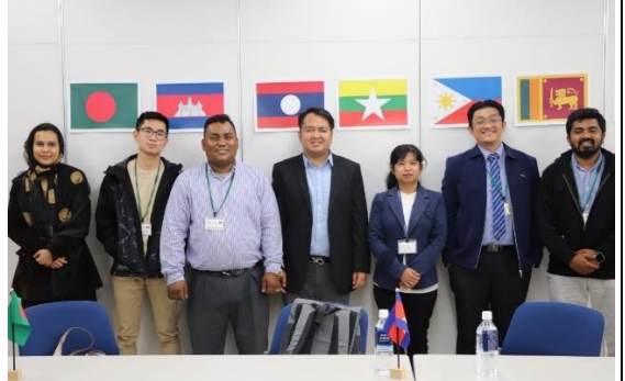
Seven trainees who participated in this program

Through the BHN Human Resource Development Program, BHN provides training for the development of expertise and the acquisition of wide-ranging knowledge, a good sense of balance and international sensibilities to hopeful participating trainees involved in government or operations in the telecommunications field in each country in Asia.