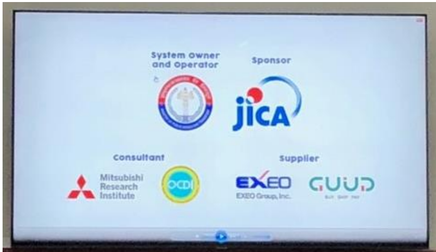
Stakeholders projected on the large screen of Ceremony)