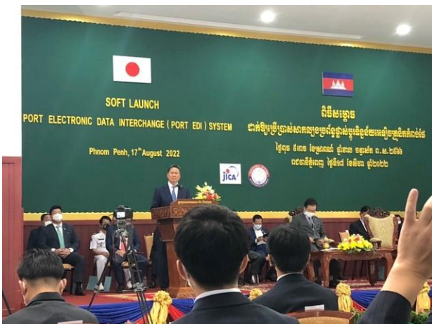
Minister of MPWT Speech